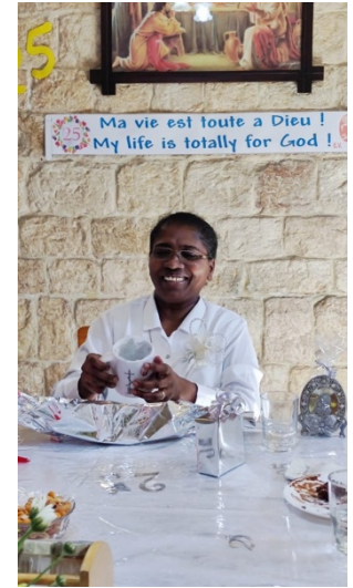
Sr Sengol with the gifts